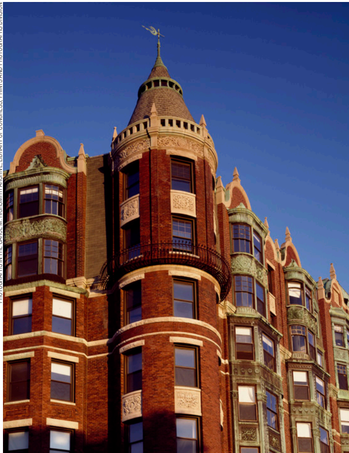
Boston's Back Bay