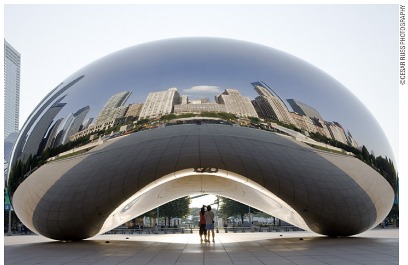
Cloud Gate Sculpture at Millennium Park, Chicago

Convention forums are large public meetings on topics of broad interest; they may be organized by individual members, divisions, discussion groups, MLA committees, allied organizations, or the American Literature Section. For information on organizing forums, visit www.mla.org/conv_procedures . The deadline for online submissions is 1 April 2013. The executive director welcomes inquiries ( execdirector@mla.org ).